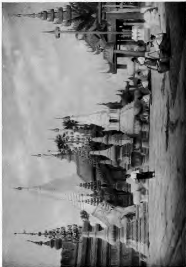
THE SHWE ZOON PAGODA, PAGAN. Placer 52.